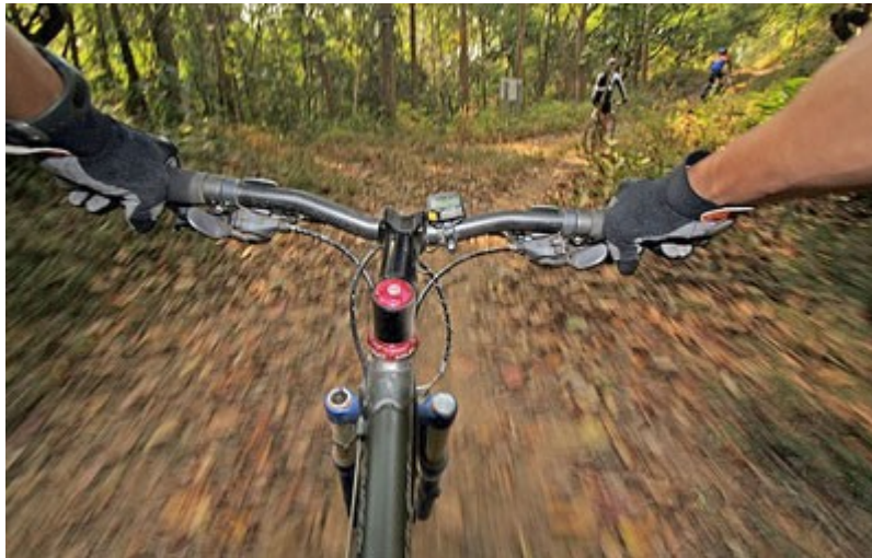
Riding a mountain bike is just one of the many fun ways I like to stay active!

Getting in the habit of being active is one of the most vital steps to helping maintain muscle, functionality, reduce injuries, lower stress and yes even help you burn more fat.